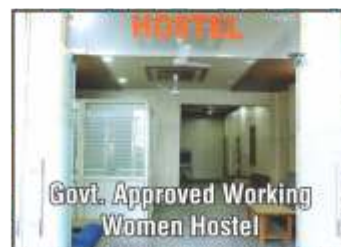
Govt. Approved Working Women Hostel