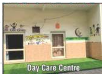
Day Care Centre