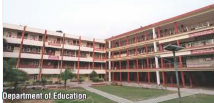
Department of Education